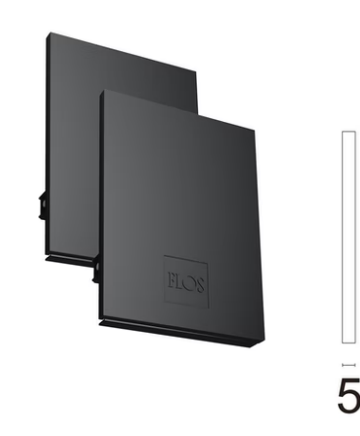
Metal End Cap. Recessed No Trim / Surface / Suspension Down. 35 mm (Colour Black) 08.9050.NS