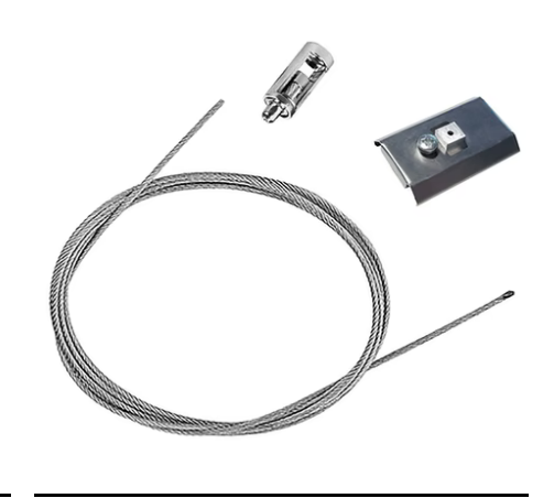
Suspension kit 08.0030