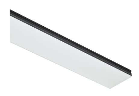
500 mm opal diffuser. Diffuse, glare free and uniform lighting throughout the room