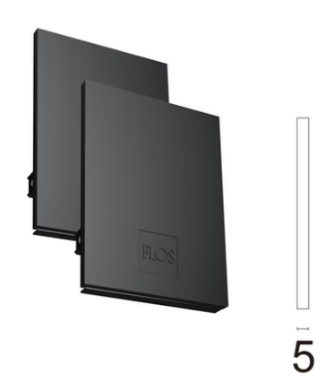
Metal End Cap. Recessed No Trim / Surface / Suspension Down. 35 mm (Colour Black) 08.9050.NS