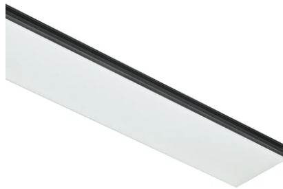
500 mm opal diffuser. Diffuse, glare free and uniform lighting throughout the room 08.0109.00