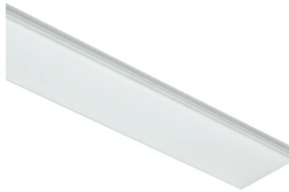
500 mm opal diffuser. Diffuse, glare free and uniform lighting throughout the room 08.0109.00