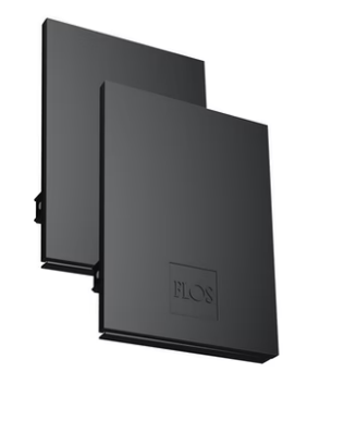
Metal End Cap. Recessed No Trim / Surface / Suspension Down. 35 mm (Colour Black) 08.9050.NS

Metal cover. Surface / Suspension Down. 35 mm 08.9050.06