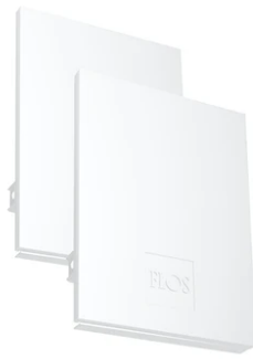
Metal cover. Surface / Suspension Down. 35 mm 08.9050.06