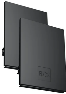
Metal End Cap. Recessed No Trim / Surface / Suspension Down. 35 mm (Colour Anodized Grey) 08.9050.02