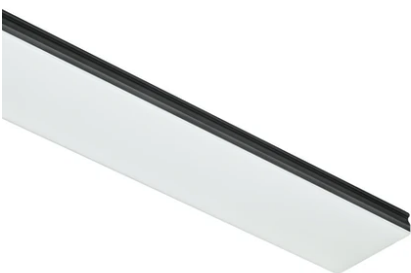
500 mm opal diffuser. Diffuse, glare free and uniform lighting throughout the room 08.0109.00