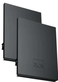
Metal cover. Recessed Trim. 35 mm (Colour White) 08.9051.40