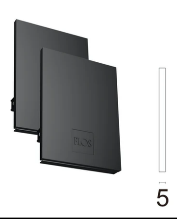
Metal cover. Recessed Trim. 35 mm (Colour Black) 08.9051.NS