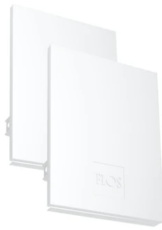
Metal cover. Suspension Up & Down. 100 mm (Colour Anodized Grey) 08.9058.02