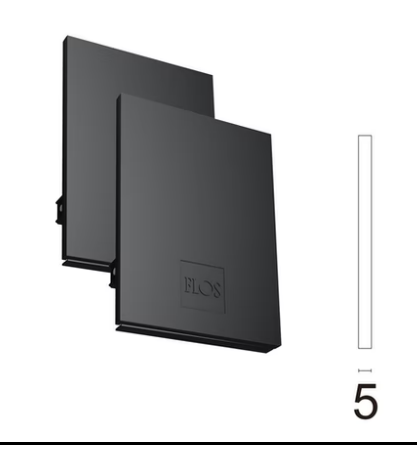
Metal cover. Suspension Up & Down. 100 mm (Colour Black) 08.9058.NS