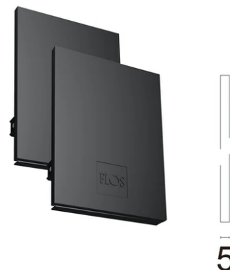
Metal cover. Suspension Up & Down. 100 mm 08.9058.06