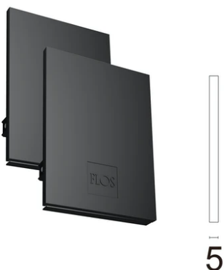
Metal cover. Suspension Up & Down. 100 mm (Colour Black) 08.9058.08