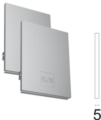
Metal cover. Suspension Up & Down. 100 mm (Colour Anodized Grey) 08.9058.02