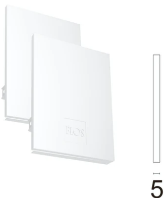
Metal cover. Suspension Up & Down. 100 mm (Colour White) 08.9058.40