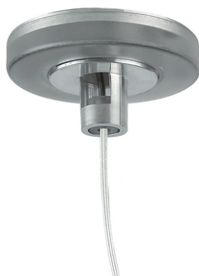
Power supply rose. Dali 08.0031.00.DA