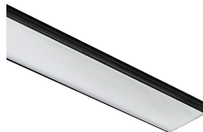
500 mm micro-prismatic diffuser. Highly efficient multilayer diffuser that, thanks to its unique microprismatic texture, provides a glare free UGR<19 light beam 08.0114.00