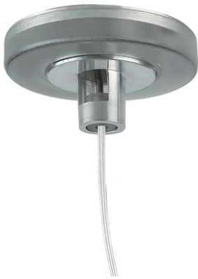
Power supply rose 08.0031.00