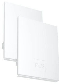
Metal cover. Suspension Up & Down. 100 mm 08.9058.06