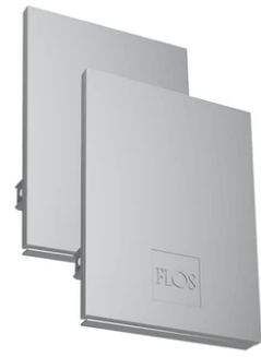
Metal cover. Suspension Up & Down. 100 mm (Colour White) 08.9058.40