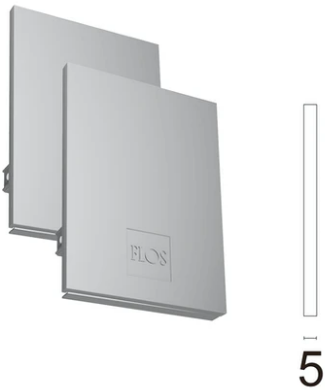
Metal cover. Suspension Up & Down. 100 mm (Colour Anodized Grey) 08.9058.02