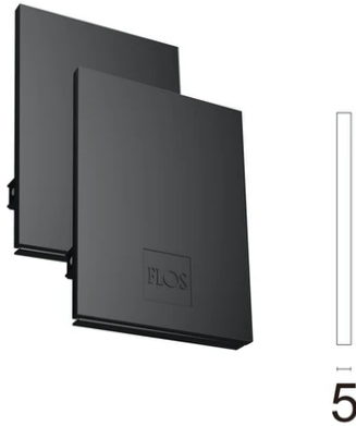
Metal cover. Suspension Up & Down. 100 mm (Colour Black) 08.9058.NS