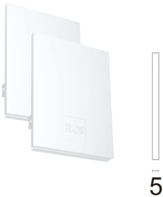
Metal cover. Suspension Up & Down. 100 mm (Colour White) 08.9058.40