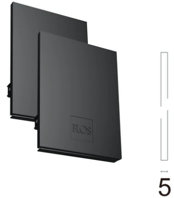
Metal cover. Suspension Up & Down. 100 mm 08.9058.06