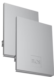
Metal cover. Suspension Up & Down. 100 mm 08.9058.06