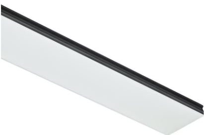
500 mm opal diffuser. Diffuse, glare free and uniform lighting throughout the room 08.0111.00