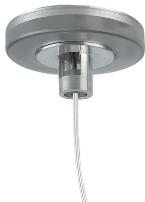
Power supply rose 08.0031.00