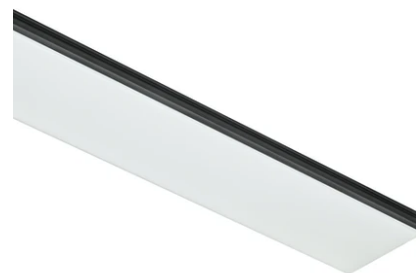
500 mm opal diffuser. Diffuse, glare free and uniform lighting throughout the room 08.0111.00