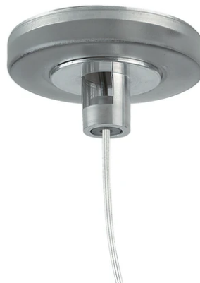
Power supply rose. Dali 08.0031.00.DA