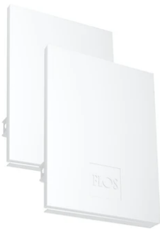
Metal cover. Suspension Up & Down. 100 mm 08.9058.06