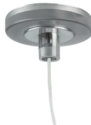
Power supply rose. Dali 08.0031.00.DA