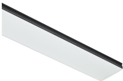
500 mm opal diffuser. Diffuse, glare free and uniform lighting throughout the room 08.0111.00