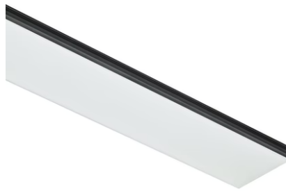
500 mm opal diffuser. Diffuse, glare free and uniform lighting throughout the room 08.0111.00