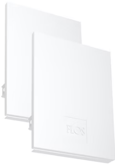
Metal cover. Suspension Up & Down. 100 mm 08.9058.06