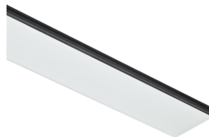
500 mm opal diffuser. Diffuse, glare free and uniform lighting throughout the room 08.0111.00