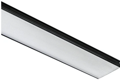
500 mm micro-prismatic diffuser. Highly efficient multilayer diffuser that, thanks to its unique microprismatic texture, provides a glare free UGR<19 light beam 08.0114.00