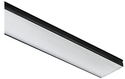
500 mm micro-prismatic diffuser. Highly efficient multilayer diffuser that, thanks to its unique microprismatic texture, provides a glare free UGR<19 light beam 08.0114.00