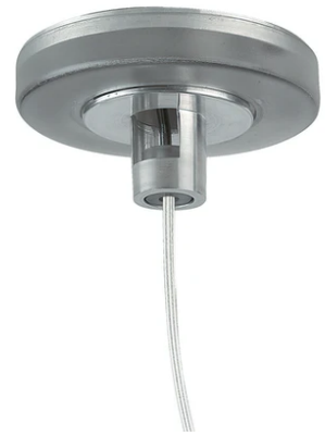
Metal cover. Suspension Up & Down. 100 mm (Colour Anodized Grey) 08.9058.02