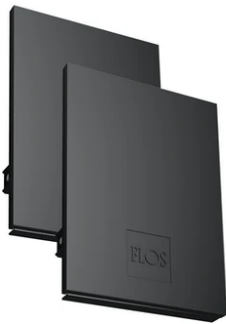
500 mm micro-prismatic diffuser. Highly efficient multilayer diffuser that, thanks to its unique microprismatic texture, provides a glare free UGR<19 light beam 08.0114.00