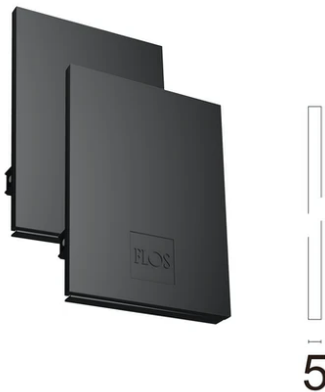
Metal cover. Suspension Up & Down. 100 mm 08.9058.06