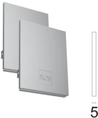
Metal cover. Suspension Up & Down. 100 mm (Colour Anodized Grey) 08.9058.02