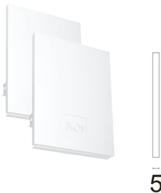
Metal cover. Suspension Up & Down. 100 mm (Colour White) 08.9058.40