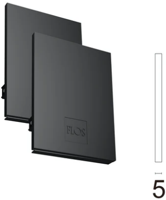
Metal cover. Suspension Up & Down. 100 mm (Colour Black) 08.9058.NS