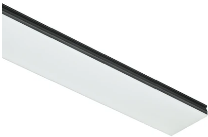
500 mm opal diffuser. Diffuse, glare free and uniform lighting throughout the room 08.0111.00