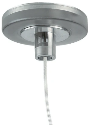
Power supply rose 08.0031.00