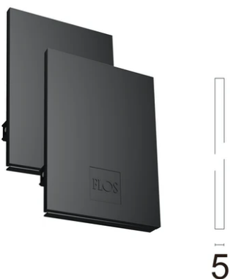
Metal cover. Suspension Up & Down. 100 mm 08.9058.06