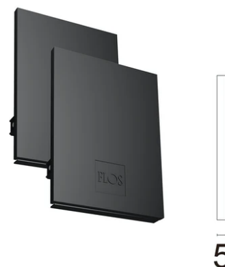
Metal cover. Suspension Up & Down. 100 mm (Colour Black) 08.9058.NS