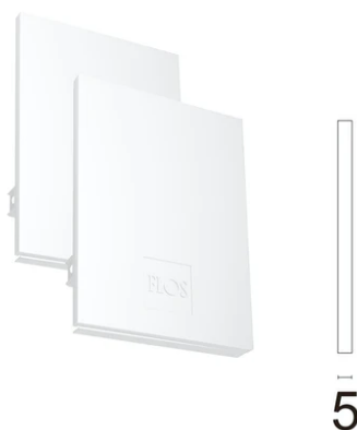
Metal cover. Suspension Up & Down. 100 mm (Colour White) 08.9058.40