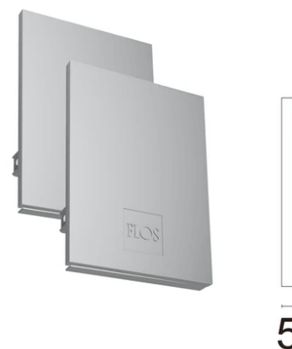
Metal cover. Suspension Up & Down. 100 mm (Colour Anodized Grey) 08.9058.02