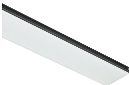
500 mm opal diffuser. Diffuse, glare free and uniform lighting throughout the room 08.0111.00