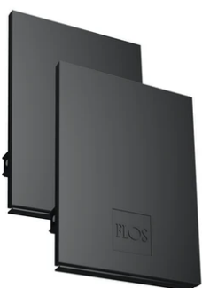
Metal cover. Suspension Up & Down. 100 mm (Colour Anodized Grey) 08.9058.02