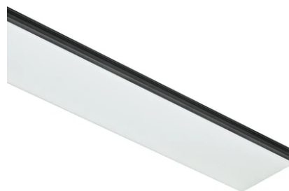
500 mm opal diffuser. Diffuse, glare free and uniform lighting throughout the room 08.0111.00