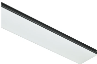
500 mm opal diffuser. Diffuse, glare free and uniform lighting throughout the room 08.0111.00