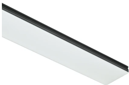
500 mm opal diffuser. Diffuse, glare free and uniform lighting throughout the room 08.0111.00