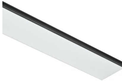
500 mm opal diffuser. Diffuse, glare free and uniform lighting throughout the room 08.0111.00