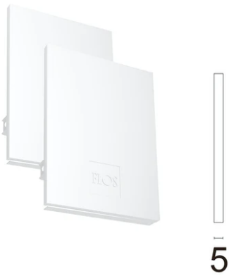
Metal cover. Suspension Up & Down. 100 mm (Colour White) 08.9058.40