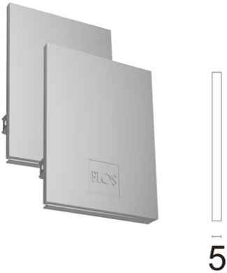
Metal cover. Suspension Up & Down. 100 mm (Colour Anodized Grey) 08.9058.02