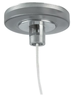
Power supply rose. Dali 08.0031.00.DA