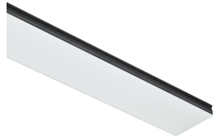
500 mm opal diffuser. Diffuse, glare free and uniform lighting throughout the room 08.0111.00