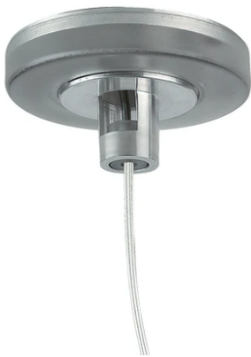
Power supply rose 08.0031.00