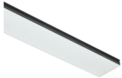
500 mm opal diffuser. Diffuse, glare free and uniform lighting throughout the room 08.0111.00