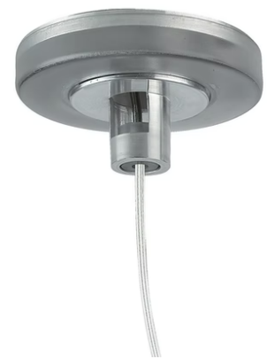
Power supply rose 08.0031.00