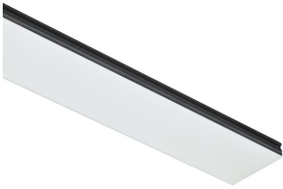
500 mm opal diffuser. Diffuse, glare free and uniform lighting throughout the room 08.0111.00