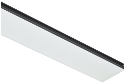
500 mm opal diffuser. Diffuse, glare free and uniform lighting throughout the room 08.0111.00