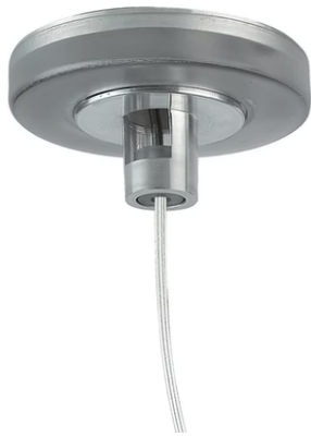
Power supply rose. Dali 08.0031.00.DA