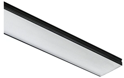
500 mm micro-prismatic diffuser. Highly efficient multilayer diffuser that, thanks to its unique microprismatic texture, provides a glare free UGR<19 light beam 08.0114.00