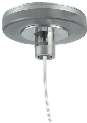
Power supply rose. Dali