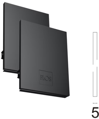
Metal cover. Surface / Suspension Down. 100 mm 08.9054.06