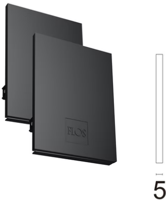
Metal End Cap. Recessed No Trim / Surface / Suspension Down. 100 mm (Colour Black) 08.9054.NS