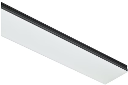
500 mm opal diffuser. Diffuse, glare free and uniform lighting throughout the room 08.0111.00