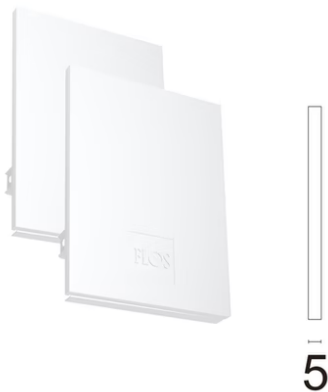
Metal End Cap. Recessed No Trim / Surface / Suspension Down. 100 mm (Colour White) 08.9054.40