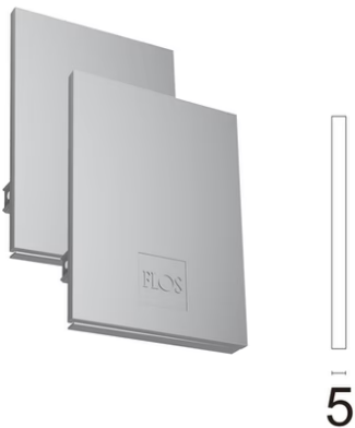
Metal End Cap. Recessed No Trim / Surface / Suspension Down. 100 mm (Colour Anodized Grey) 08.9054.02