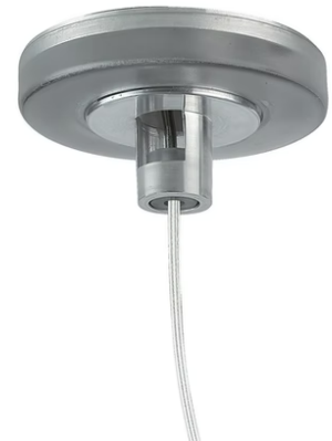
Power supply rose. Dali 08.0031.00.DA