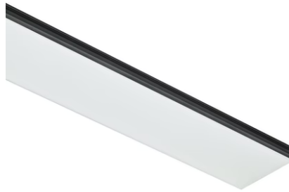
500 mm opal diffuser. Diffuse, glare free and uniform lighting throughout the room 08.0111.00