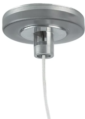
Power supply rose. Dali 08.0031.00.DA