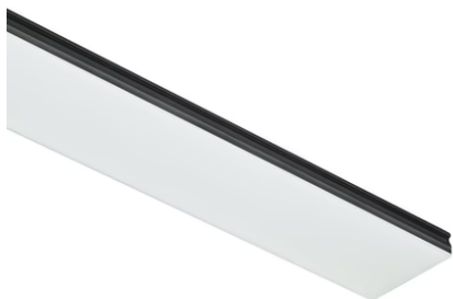
500 mm opal diffuser. Diffuse, glare free and uniform lighting throughout the room 08.0111.00