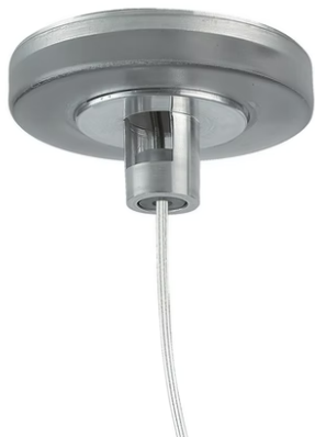
Power supply rose