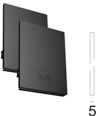
Metal cover. Surface / Suspension Down. 100 mm 08.9054.06