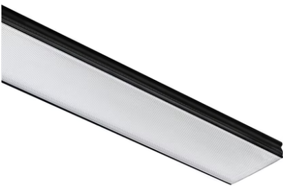
500 mm micro-prismatic diffuser. Highly efficient multilayer diffuser that, thanks to its unique microprismatic texture, provides a glare free UGR<19 light beam 08.0114.00