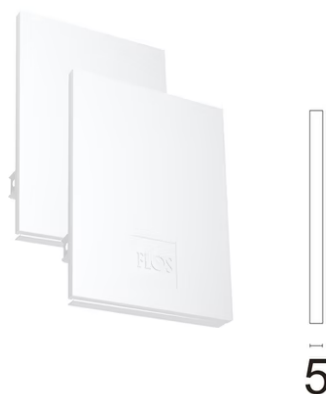
Metal End Cap. Recessed No Trim / Surface / Suspension Down. 100 mm (Colour White) 08.9054.40