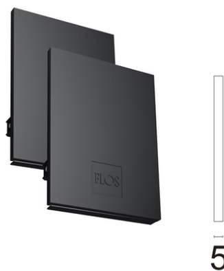
Metal End Cap. Recessed No Trim / Surface / Suspension Down. 100 mm (Colour Black) 08.9054.NS