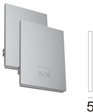
Metal End Cap. Recessed No Trim / Surface / Suspension Down. 100 mm (Colour Anodized Grey) 08.9054.02