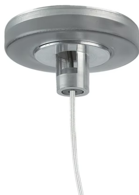
Power supply rose. Dali 08.0031.00.DA