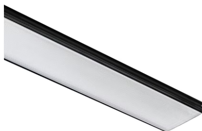
500 mm micro-prismatic diffuser. Highly efficient multilayer diffuser that, thanks to its unique microprismatic texture, provides a glare free UGR<19 light beam 08.0114.00