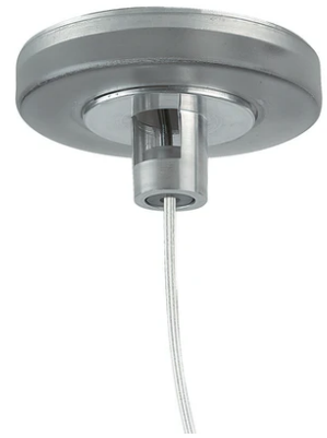
Metal End Cap. Recessed No Trim / Surface / Suspension Down. 100 mm (Colour Anodized Grey) 08.9054.02