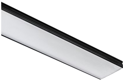
500 mm micro-prismatic diffuser. Highly efficient multilayer diffuser that, thanks to its unique microprismatic texture, provides a glare free UGR<19 light beam 08.0114.00