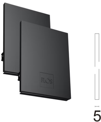
Metal cover. Surface / Suspension Down. 100 mm 08.9054.06