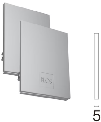
Metal End Cap. Recessed No Trim / Surface / Suspension Down. 100 mm