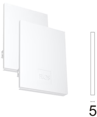
Metal End Cap. Recessed No Trim / Surface / Suspension Down. 100 mm (Colour White) 08.9054.40