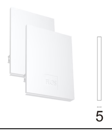
Metal End Cap. Recessed No Trim / Surface / Suspension Down. 100 mm (Colour White)