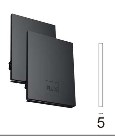
Metal End Cap. Recessed No Trim / Surface / Suspension Down. 100 mm (Colour Black) 08.9054.NS