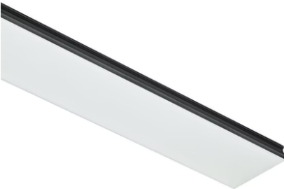
500 mm opal diffuser. Diffuse, glare free and uniform lighting throughout the room