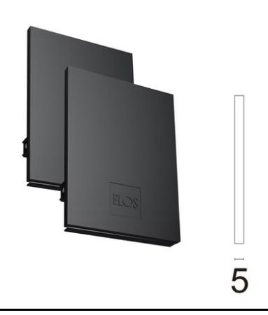
Metal End Cap. Recessed No Trim / Surface / Suspension Down. 100 mm (Colour Black) 08.9054.NS