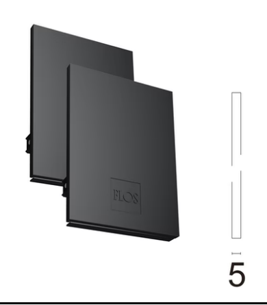
Metal cover. Surface / Suspension