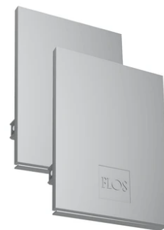
Metal cover. Surface / Suspension Down. 100 mm 08.9054.06