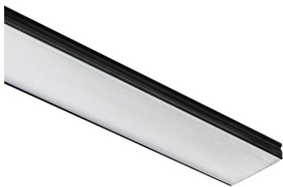
500 mm micro-prismatic diffuser. Highly efficient multilayer diffuser that, thanks to its unique microprismatic texture, provides a glare free UGR<19 light beam 08.0114.00