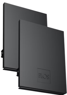
Metal End Cap. Recessed No Trim / Surface / Suspension Down. 100 mm (Colour Anodized Grey) 08.9054.02