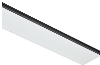
Metal End Cap. Recessed No Trim / Surface / Suspension Down. 100 mm (Colour White) 08.9054.40