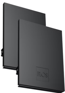
500 mm opal diffuser. Diffuse, glare free and uniform lighting throughout the room 08.0111.00