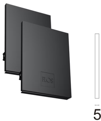
Metal End Cap. Recessed No Trim / Surface / Suspension Down. 100 mm (Colour Black) 08.9054.NS