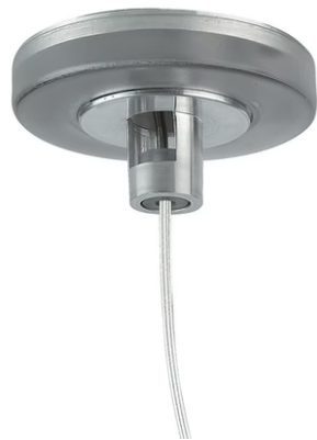
Power supply rose 08.0031.00