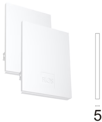
Metal End Cap. Recessed No Trim / Surface / Suspension Down. 100 mm (Colour White) 08.9054.40