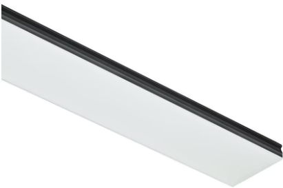
500 mm opal diffuser. Diffuse, glare free and uniform lighting throughout the room 08.0111.00