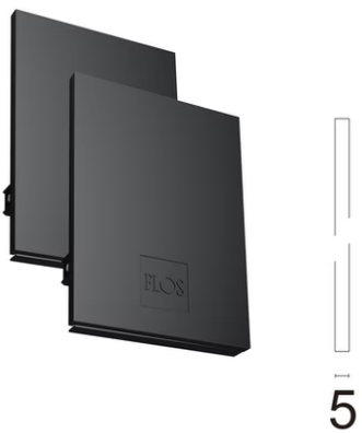
Metal cover. Surface / Suspension Down. 100 mm 08.9054.06