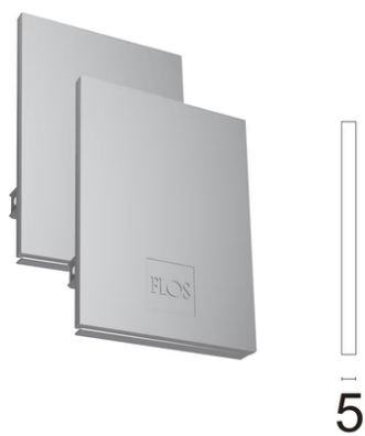
Metal End Cap. Recessed No Trim / Surface / Suspension Down. 100 mm (Colour Anodized Grey) 08.9054.02